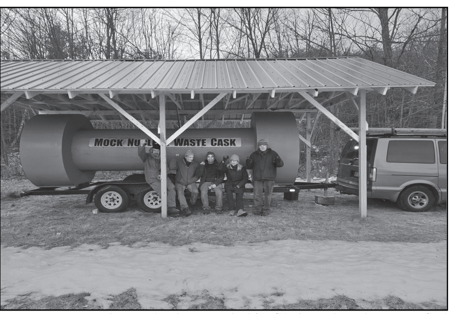
The completed storage shed for CAN's Mock Nuclear Waste Cask